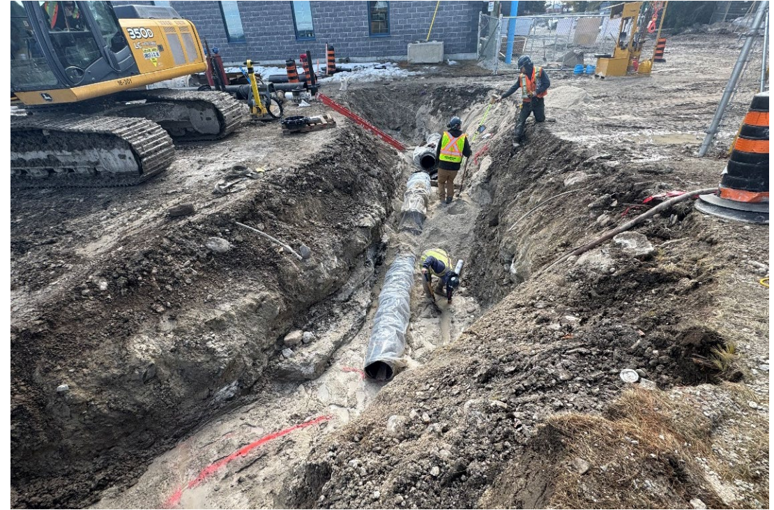
Installation of temporary yard piping for temporary Industrial Supply pump station.