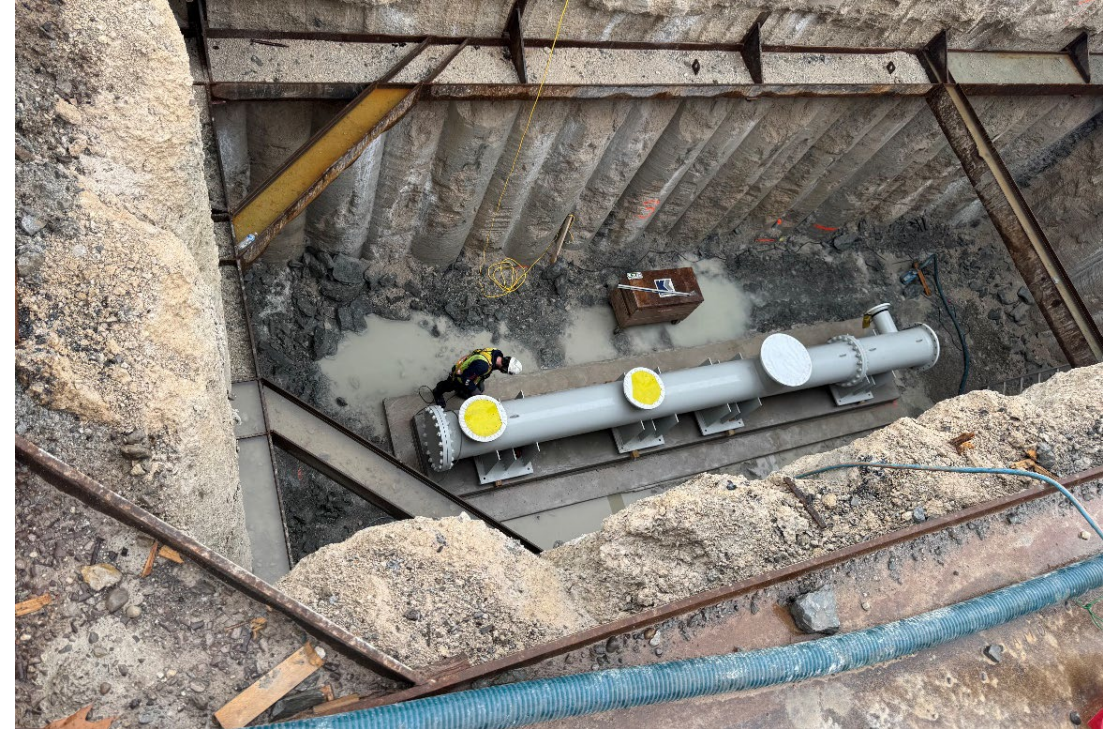
Temporary Industrial Supply pump station excavation. Suction header installed on base slab.