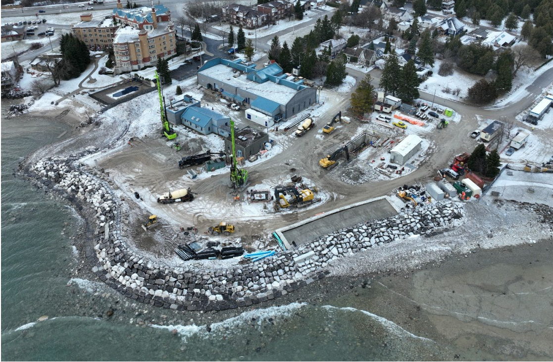
Site aerial photo March 2025. Construction dewatering area constructed in north west corner.