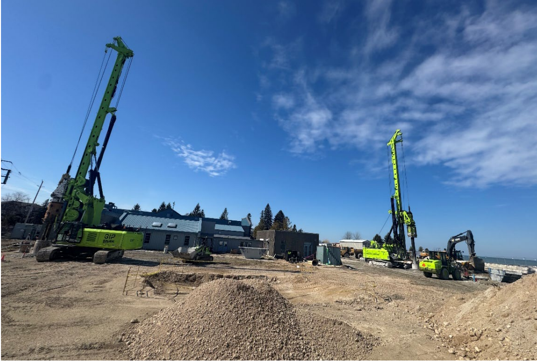
Second drill rig mobilized to site. Drilling caissons for surge chamber and membrane building.