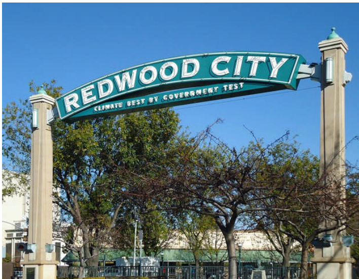
Red wood City CA